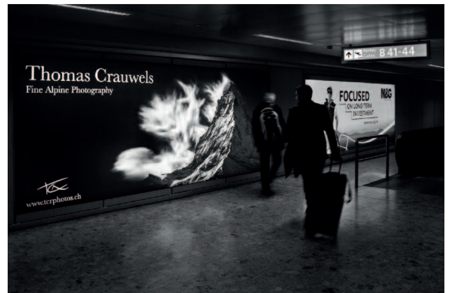
Geneva Airport, 2m x 5m panel