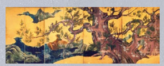
Cypress Trees Kanô Eitoku