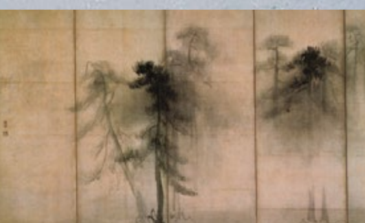
Pine Trees Hasegawa Tôhaku